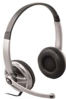
Stroke and Turn Judge